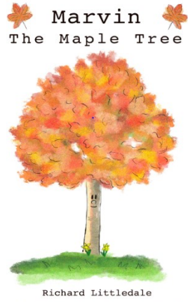
Richard Littledale Illustrated by Tara Simmons

'Marvin the Maple Tree' is now available to any parents or carers who might need it in order to have that hardest of conversations with a child. It can be downloaded for free <u>here</u>. If people would prefer, they can buy it on Kindle <u>here</u>. The cost is £1, and all royalties go to NHS Charities Together.